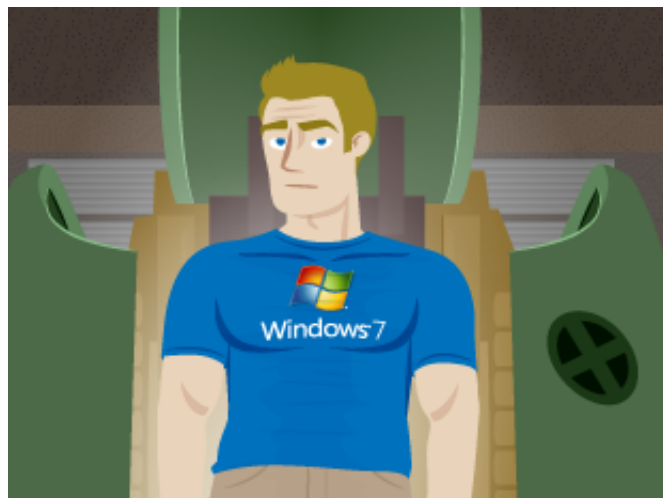
Illustration: Gordon McAlpin

Just like Captain America, you too can upgrade to a stronger, faster and better form: Upgrade from XP to Windows 7. We're going to take you through the steps involved in updating your OS to the most current one. It's pretty simple, actually. (You may want to print this page for reference, as your PC will be rebooting several times through the installation.)